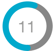
AVERAGE DRYING TIME (SECONDS)