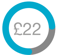
AVERAGE RUN COST (PER ANNUM)**

A blue guidance light indicates where hands gain optimum drying position whilst an LED display indicates to the user when the dryer is active.